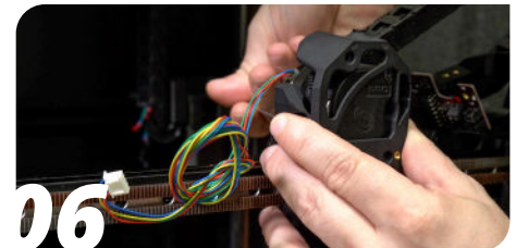
06 Tighten the two screws holding the extruder to your x-carriage.