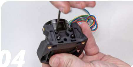
04 Insert the four M3x14 SHCS screws and tighten them