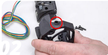
02 Insert the PTFE coupler in the LGX lite mount