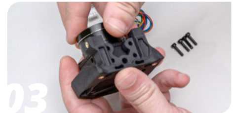
03 Take the LGX lite and place it in the mount